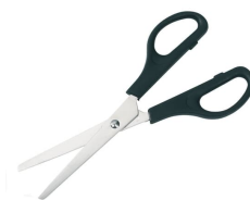
General Purpose Scissors