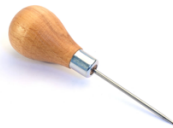
Bradawl / Awl