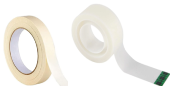
Masking or Magic Tape (not Sellotape)