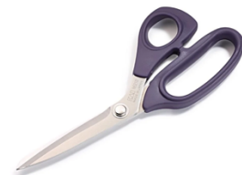
Dressmakers Shears – 10" / 25cm (Fabric Only)