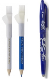
Chalk Pencil or “Frixon” Erasable Pen