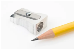
Pencils (HB and 2H) plus Sharpener