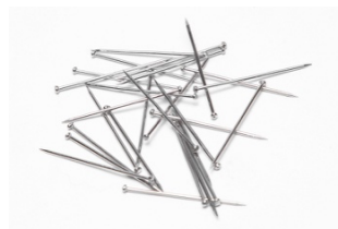
Dressmakers Pins – Extra Fine