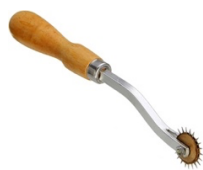
Tracing Wheel (Needle Point)