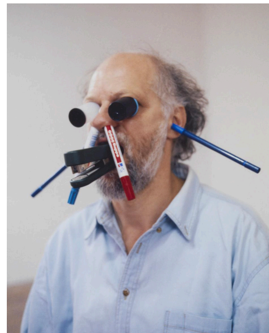
Ervin Wurm 1997.